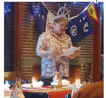
and Stephen King share their thoughts.