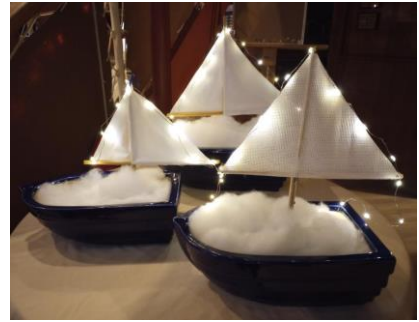
The entry table