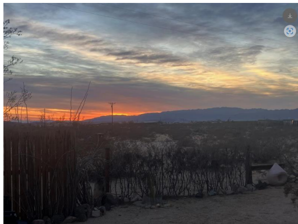
A sailor's dawn, as seen by Uli Spang wintering in the south.