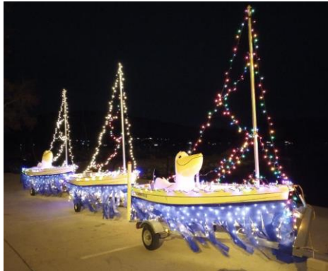
These Pelican skippers were prize winners in the Snowflake Parade!