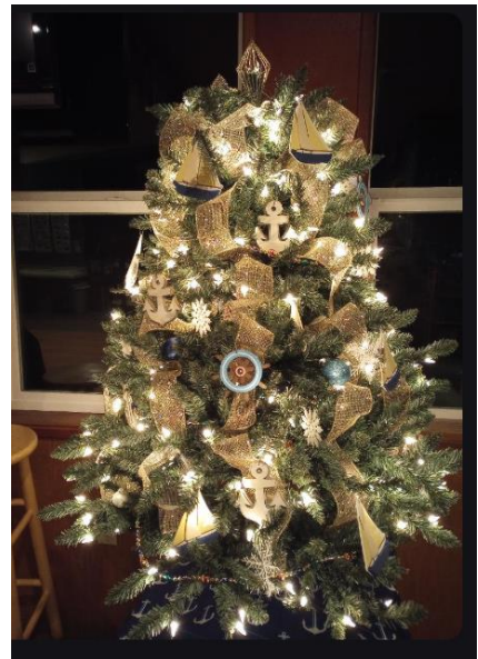
The sailing tree, by night...