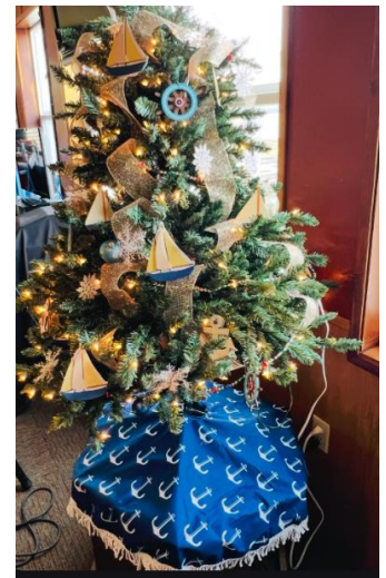
...and by day.